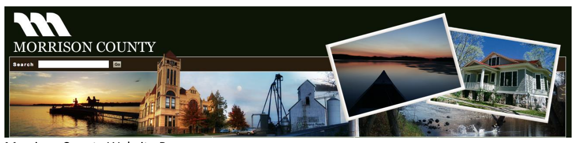
Morrison County Website Banner

1) Morrison County Tourism agreement. Morrison County and the cities within Morrison County are working with the Little Falls Convention and Visitors Bureau and Explore MN on a shared tourism plan.